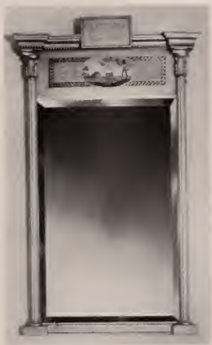
161—DECORATED GILDED ADAM MANTEL MIRROR